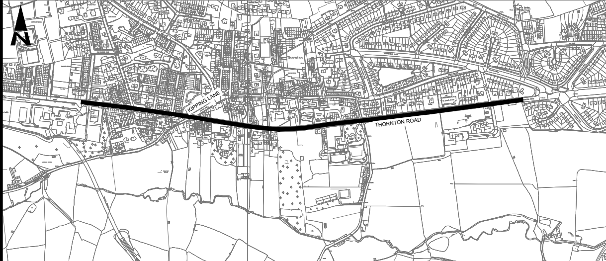
LOCATION 1 - ASHFIELD ROAD TO SPRINGHEAD ROAD